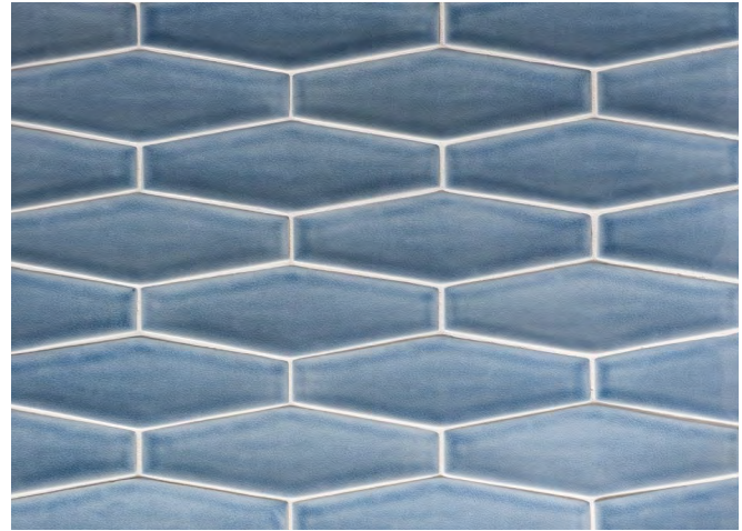
TONAL VARIATION WITH LIGHT & DARK TILE

Make sure your installer reads our installation instructions thoroughly to achieve the best look.